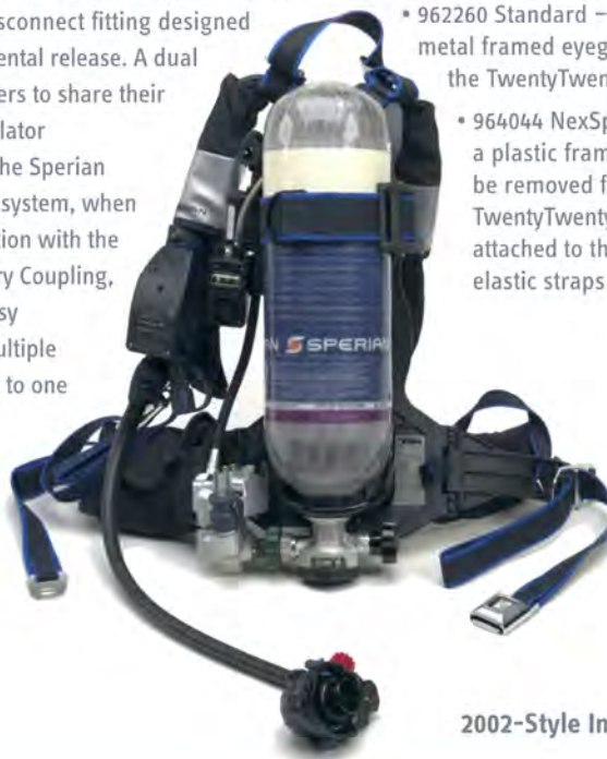
2002-Style Industrial Panther