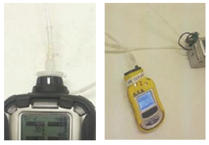
Connecting MultiRAE Pro and ToxiRAE Pro PID to the jug tubing.

• For a ToxiRAE Pro, use the plastic cap from the kit. Attach the cap with tubing to an additional external pump with a power supply to deliver gas from a jug to an instrument.