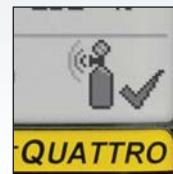
Simple, visual compliance