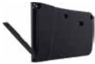
RT10-CAC - AVAILABLE IN US AND EUROPE ONLY