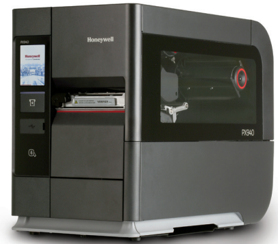
Honeywell PX940 high-performance industrial printer with integrated label verification