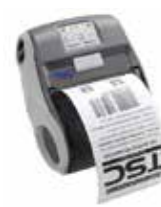
TSC Alpha 3R