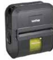
Brother RJ4030 / RJ4031