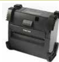
Toshiba (TEC) B-EP4DL