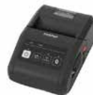
Brother RJ3050 / RJ3150