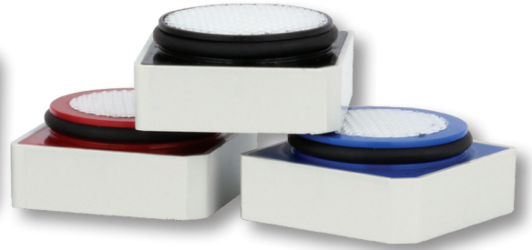
Honeywell iseries digital gas sensors