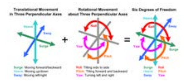
Figure 1. TARS Six Degrees of Freedom