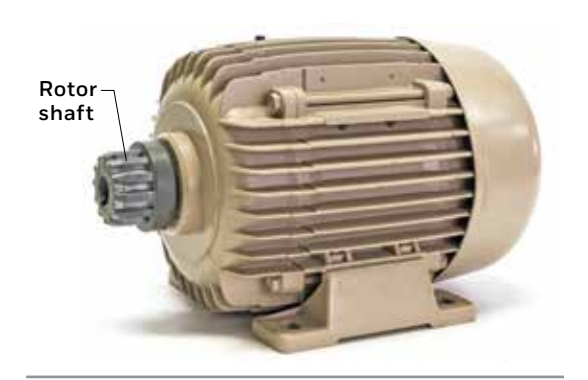
Figure 2: Basic AC Motor Rotor Shaft

How SNG-Q Series Quadrature Speed and Direction Sensors Work