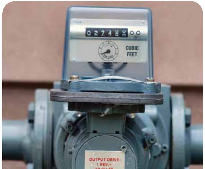
Gas Leak Detection

Customer Benefits: Helps the HVAC system produce cleaner, purer air, reduces indoor air quality-related problems and improves energy efficiency.