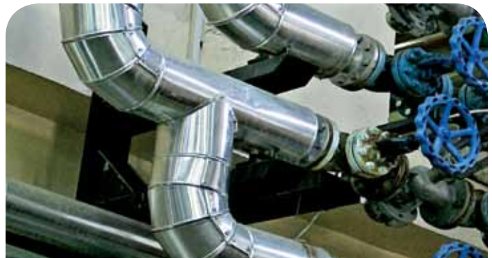
VAV System on HVAC Systems