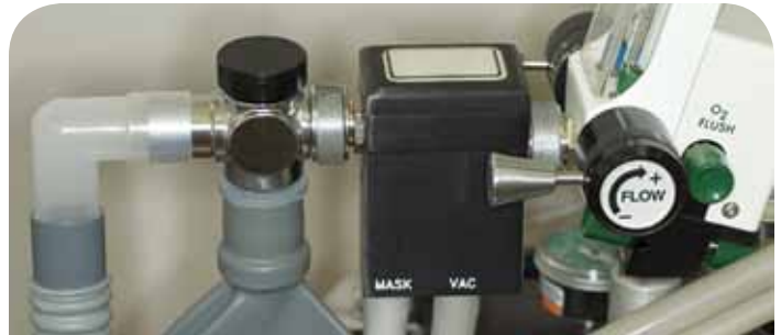
Anesthesia delivery machine