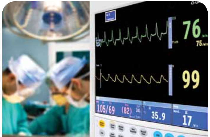
Patient Monitoring System