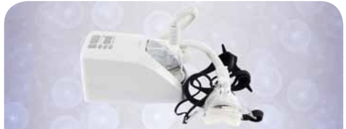
Sleep Apnea Machine