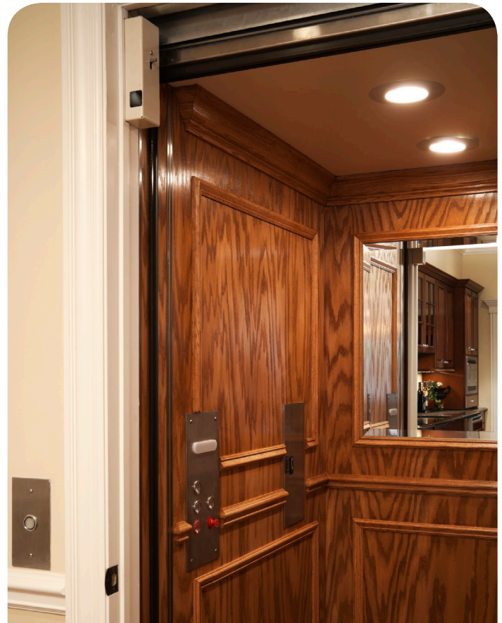
A home elevator featuring a residential door interlock switch.

Honeywell Relialign™ RDI interlocks assist in the secure and safe operation of manual elevation equipment. For example, residential elevators are found in many homes where the residents desire the ease of a powered elevator to take them to different floors. Honeywell's door interlock switches are designed with a housing that allows them to seamlessly fit into the application and the doorway. When installed, the RDI guards against accidental opening of the elevator door in a unsafe situation. If the elevator car is not present or in transit, the Relialign™ interlock will be engaged and not allow the door to be opened.