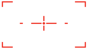
Figure 2. Laser Aimer