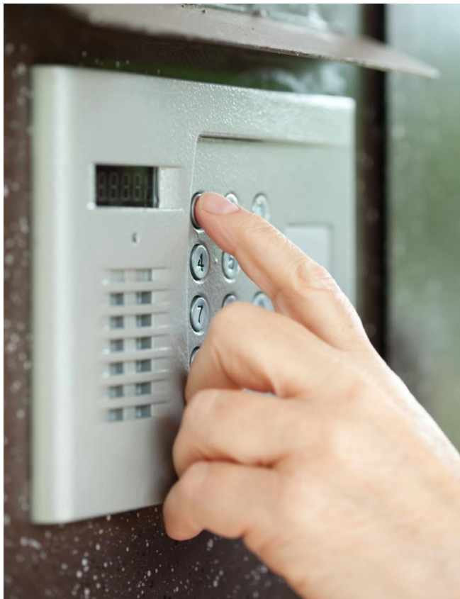
Figure 3. Electronic Locks

Without reproducing the exact magnetic flux pattern, it would be virtually impossible to unlock the system with a single, or even multiple, strong magnets. Tiny Honeywell SS39ET Surface-Mount Linear Hall-effect Sensor ICs would provide the needed sensitivity, output and very small size.