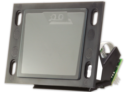
CF4680 Imager Module

The CF4680 2D Imager Module offers close-to-contact scanning operation so that end-users can intuitively read any standard 1D or 2D barcode by simply approaching or touching the CF4680 2D Imager Module's built-in exit window with their mobile phone screen, coupon, loyalty card or ticket. To eliminate unnecessary LED illumination when end-users are not using the equipment, the CF4680 2D Imager Module is equipped with an installer-selectable distance switch which will not illuminate the LED until the end-user approaches the near-field zone.