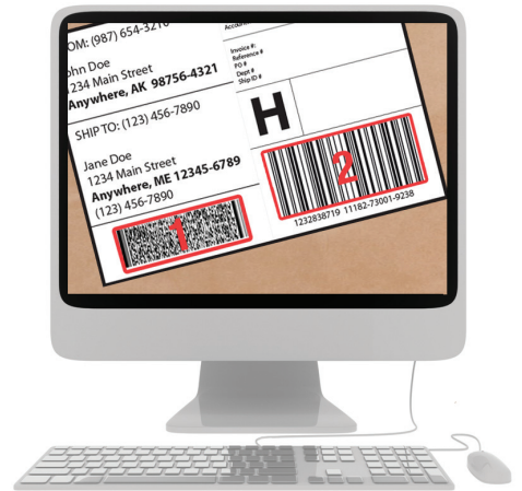
SwiftDecoder-S SDK for Non-Mobile Platforms