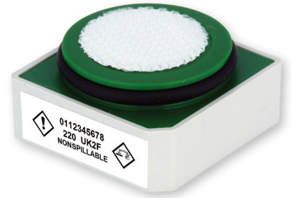
Sulphur Dioxide (SO 2 ) Sensor: 1SO 2 Part Number: AD300-R04A-CIT

With the 1series low-profile design, the sensors have turrets to mount into the front of the instrument in order to minimize instrument height. This revolutionary design also simplifies target-gas access to the sensor face and features an option for a replaceable external membrane.