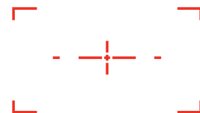
Figure 2. Laser Aimer