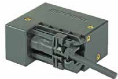
Figure 3. Ten mounting holes on five of six sides