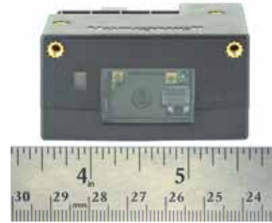
Figure 2. Slider bracket holding micro-USB cable