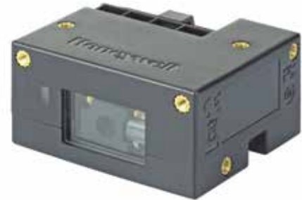
The CM Series Compact 2D Imager Module's unique design simplifies installation and deployment for a wide range of kiosk applications.