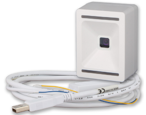
HF561 Series 2D Imager Module

The HF561 Series comes out of the box with decoded 2D optics, housing, pre-drilled mounting holes, and USB or serial interface, minimizing the need to purchase additional components when integrating into customers' devices, simplifying customer installation and helping to reduce the total cost of ownership.