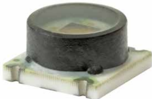
Figure 1. Basic Force Sensors: TBF Series

This Technical Note describes several compensation techniques for use with the TBF Series (Figure 1). Pinouts shown are for the Leadless SMT devices. See the published datasheets for the TBF Series pinouts.