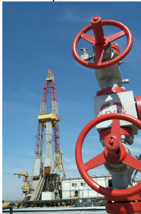
Figure 2. MICRO SWITCH™ BX Series Application