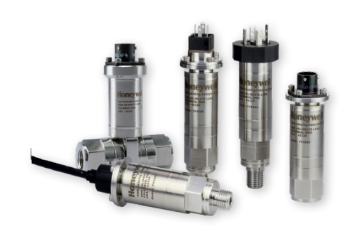
The Honeywell FP5000 Pressure Transducers offer multiple configurations and options.

Pressure feedback may be used for both control and monitoring system conditions to avoid damage/field failures or cause safety issues of other equipment, such as pumps, compressors, generators and manifolds. Pressure sensors can also be used during assembly or manufacturing processes to improve yields, automate processes, provide product validations or even for product/quality assurance measures