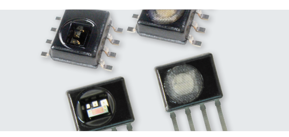
DIGITAL HUMIDITY/TEMPERATURE SENSORS, HONEYWELL HUMIDICON™ HIH6000, HIH6100, HIH7000, HIH8000