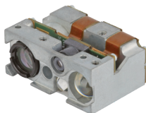
EXTRA LONG RANGE Extended FlexRange™ Series

Our engines provide high performance and reliability, increased scanning speeds and simple integration.