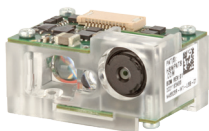
DECODED N4680 Series

Our patented technology can read low quality barcodes due to damage, distortion, poor contrast or challenging package shapes and materials. With near and far reading ranges, compact dimensions, enhanced motion tolerance, a wide temperature range and power efficiency baked in, our high performance ultra-slim series is perfect for mobile designs. Whatever your application requirements, we have a product to help.