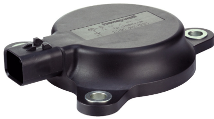
TARS-IMU: Transportation Attitude Reference Sensor (TARS) Ruggedized Inertial Measurement Unit (IMU)

Recently, a large manufacturer of skid steer loaders contacted Honeywell for a solution to address the small loaders' lack in grading and ground leveling ability. They were seeking a way to add more capability. The system had to be robust, reliable, and accurate enough to be useful, and priced competitively to not put this technology out of reach for these lower-cost loaders.