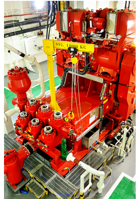
Figure 1. Blow-Out Preventer

Limit switches also can be used in grain gates that operate as valves in the grain storage and handling industry. These doors open or close and control the flow of grain. In this application, the switch detects the gate position, which is relayed to the central control unit, whereby the signal is used as process control or secondary indication. For these agricultural applications, the switches need to be sealed and be weather tight to keep out the grain particulates.