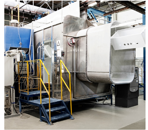
Figure 4. Painting Booth

In addition to dual bearing designs and fluorosilicon seal options, Honeywell's hazardous location switches offer sintered bronze bearings for longer operating life and increased resistance in corrosive environments, and a unique all-metal drive train for extended life and reliable operating characteristics even at high temperatures. Twin shaft seals promote additional environmental conditions, and phosphate-treated and epoxy-finished enclosures offer rugged, corrosion resistance.