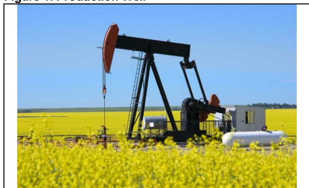
Figure 1. Production Well