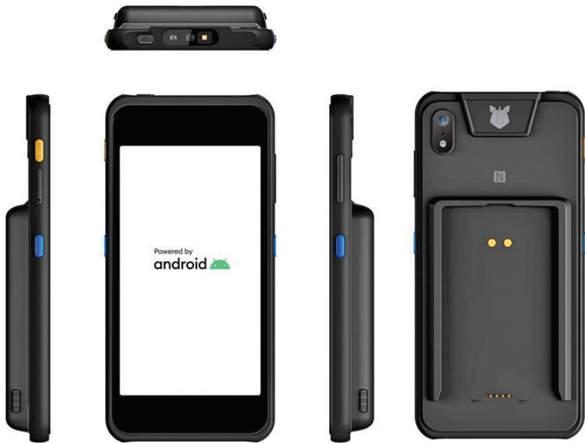
Rhino T5se handheld device