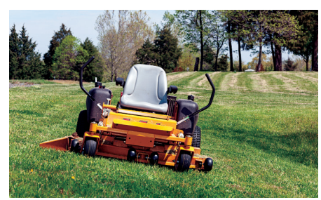
Lawn and Garden