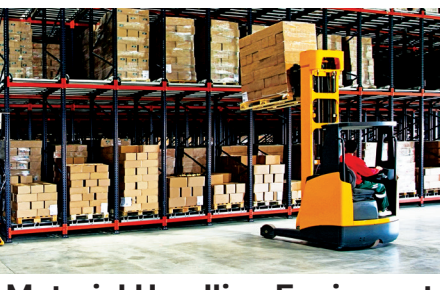
Material Handling Equipment