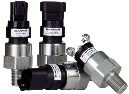
Figure 1. Honeywell Smart Pressure Switch Electrical Topology.