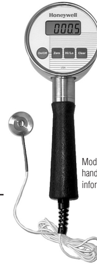
Model LK shown with optional handle. Visit our Web site for more information on optional handles.