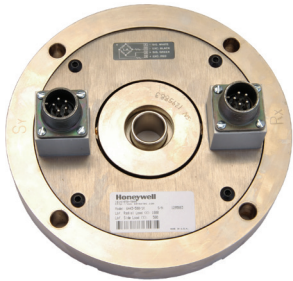
Model 6443 Series load cell

Uniformity testing machines measure both the Radial Force Variation (RFV) and the Lateral Force Variation (LFV). RFV indicates the change in force when the tire rotates under varying load conditions, and LFV represents the steering effort pull in either the left or right direction. Based on these two measures, the machines then ascertain where final grinding or cutting can optimize the tire before a final grade is applied on the finished tire. Without a uniform, properly balanced tire/wheel, a vehicle would rattle and shake. Tire uniformity testing machines are extremely important since they help provide a smooth ride. And for tire manufacturers, producing the most uniform tire allows for a higher grade of tire to be sold.