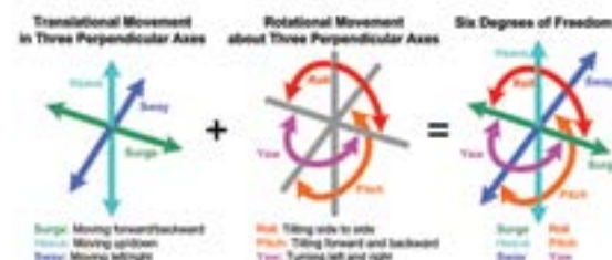
Figure 1. TARS Six Degrees of Freedom