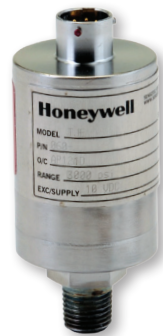
Model TJE Pressure Transducer

The test stand's data acquisition system takes the Model TJE's 0 Vdc to 5 Vdc output for recording and reporting purposes. Honeywell's Model TJE helps to measure the aircraft actuator functionality to ensure repeatable performance during aircraft utilization.