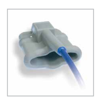
1. turn inside out